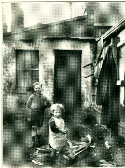
A FITZROY DWELLING

During the Christmas holidays, commencing the first Sunday after Christmas (December 29), we purpose having a series of Social gatherings in S. Mary's Hall or in the Mission Court Yard after Evensong, which commences at 7.15. The first of these gatherings will take the form of a Welcome to the Bishop of Riverina, who will be the preacher at Evensong.