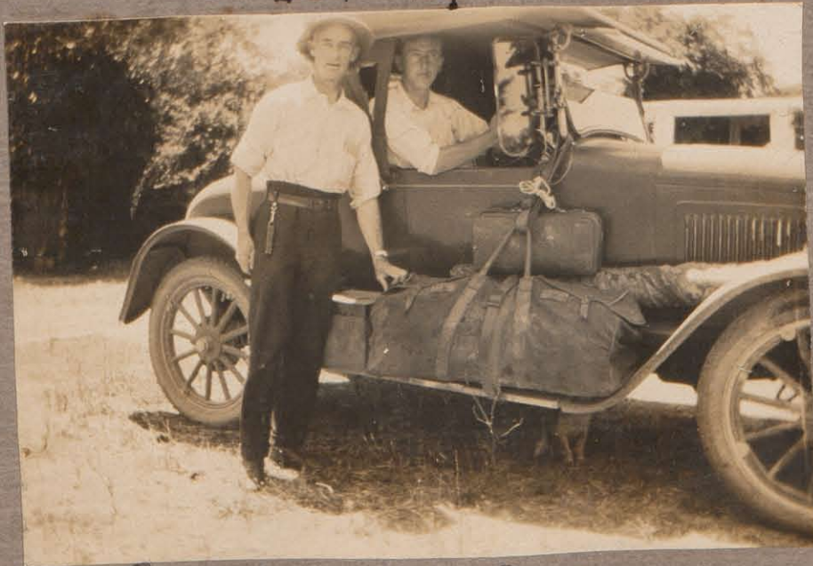
Ready to Depart.