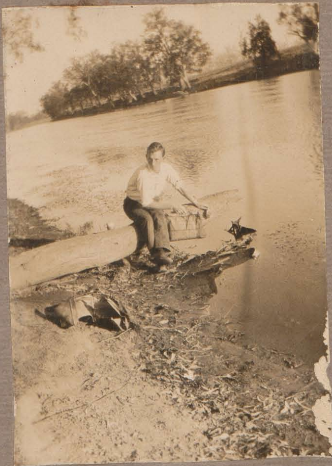
On the banks of the Murrumbidgee