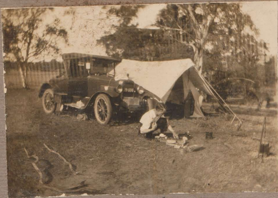
1 st camp between Sydney + Goulburn