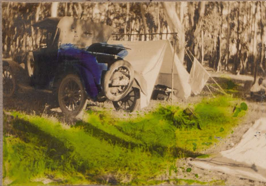
Domus Overlandorum Wangaratta