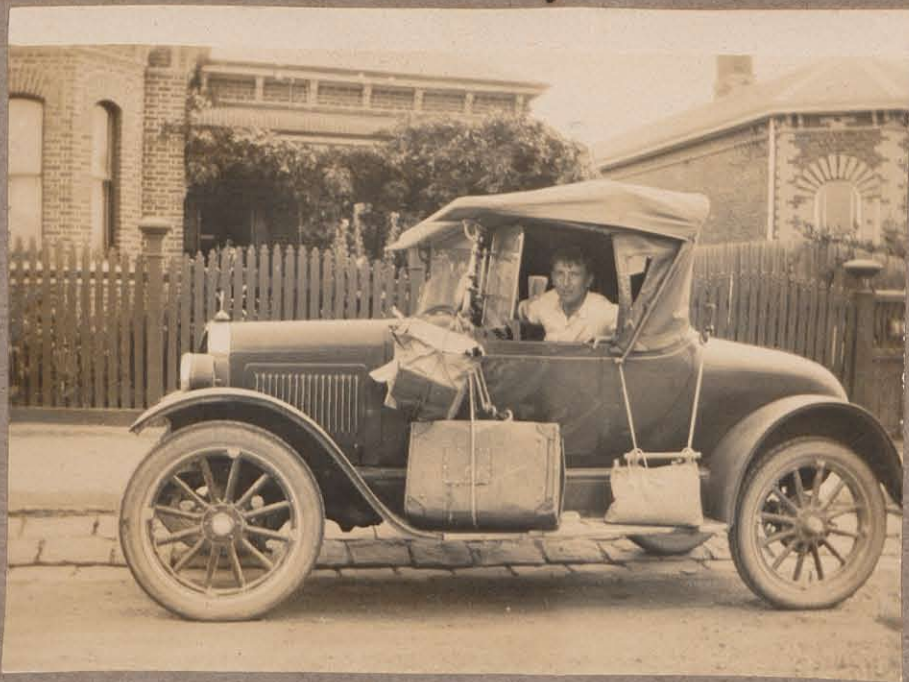
Outside 12 Housburg Grove at the End of a Perfect run,