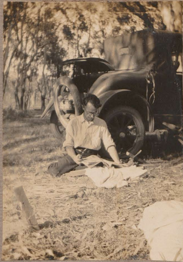
Having a spell