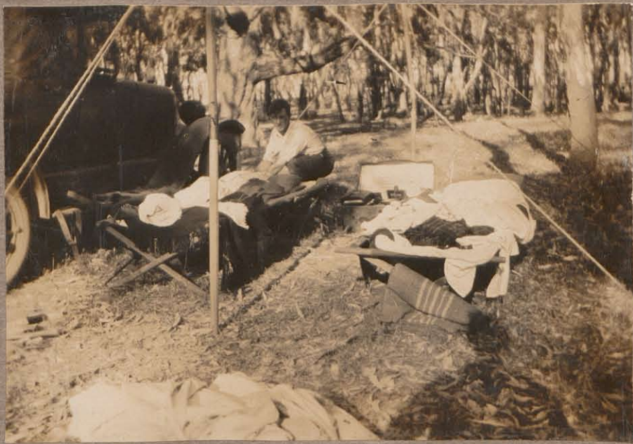
while the work is being done.