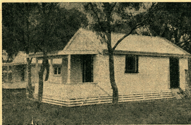
Four of these bungalows have been erected during the last twelve months. Two more are in the course of construction.

I do hope that a goodly number of you will be with us at Carrum Downs when the Lieutenant-Governor (Sir Edmund Herring) will officially open three (and I hope, four) bungalows. These have been erected during the last twelve months. I should like to take this opportunity of