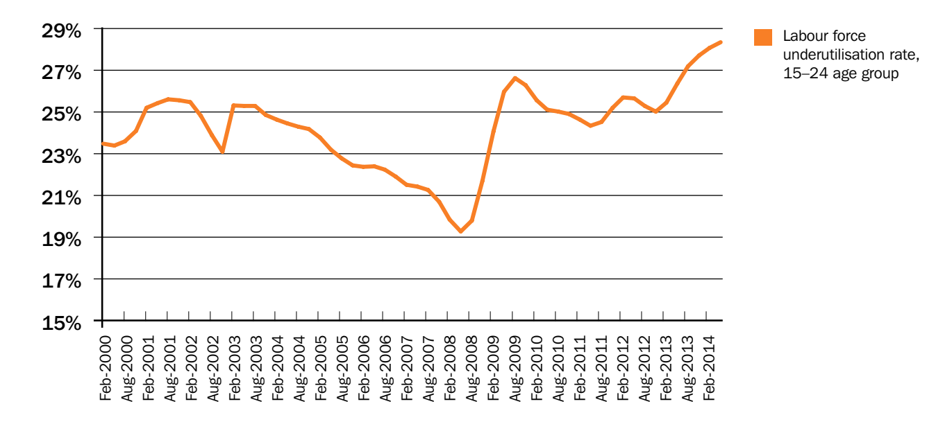
Figure 3: Labour force underutilisation rate (%), 15–24 year olds, February 2000 to May 2014

This indicates that more than a quarter of the young Australians in the labour force are either unemployed or working fewer hours than they would like. The GFC ushered in a period of tighter labour markets and limited job opportunities – especially for younger people.