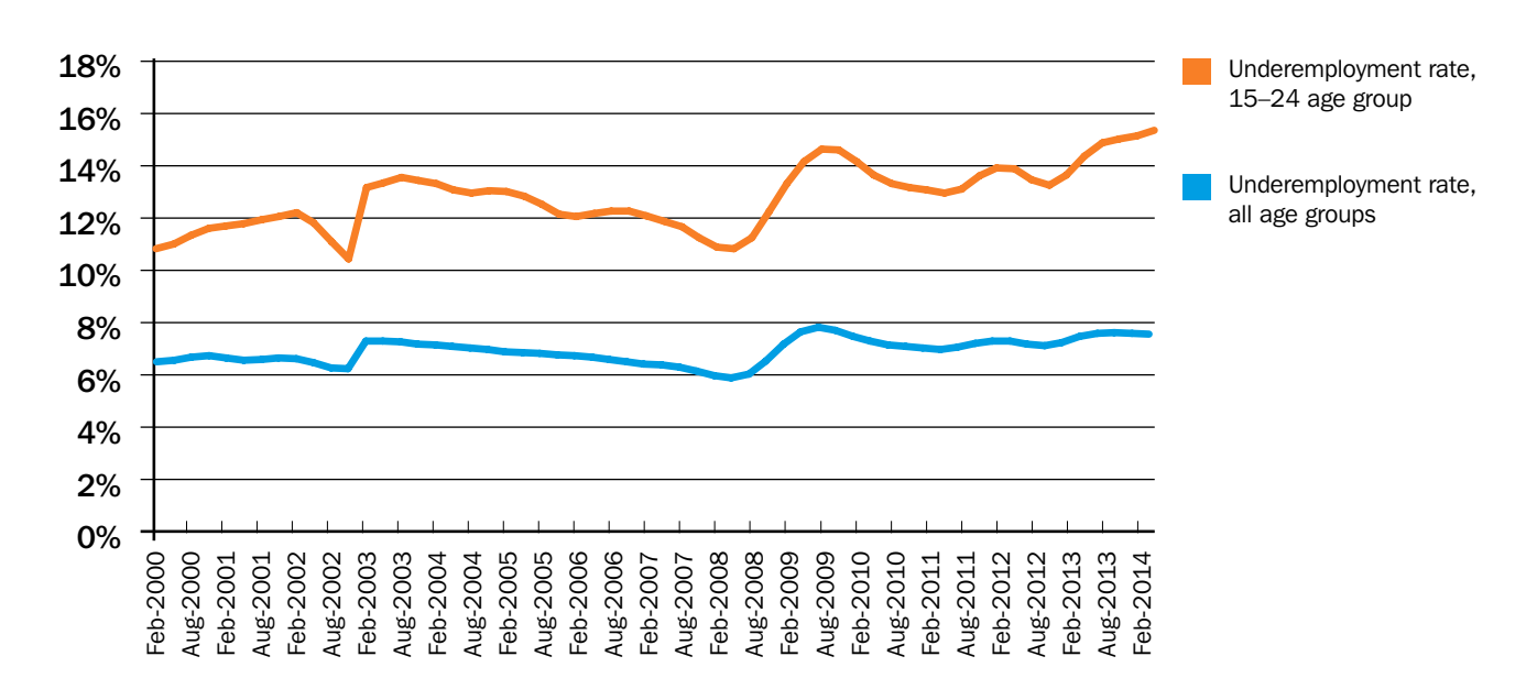
Figure 1: Underemployment rate (%), 15–24 year olds and all ages, February 2000 to May 2014

The graph also shows an upward trend in underemployment among young workers, which accelerated after the global financial crisis (GFC) in 2008. By May 2014, more than 15 per cent of workers in the 15–24 group were underemployed – the highest rate since this ABS data series started in 1978, when the rate stood at 3.1 per cent.