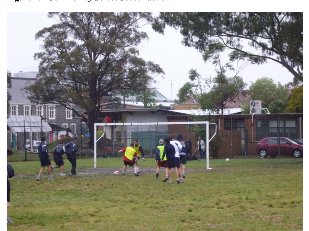
Figure 1.2 Community Street Soccer action

Steven added, people watching the Homeless World Cup don't see homeless people but athletes; it changes the dynamic. It creates a platform of commonality and the opportunity for natural mentoring: 'At the end of the day everyone looks the same in shorts'.